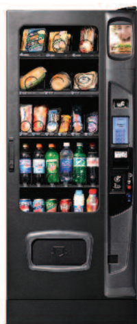
Shown in black with optional ADA door, iCart touch screen and kick panel.