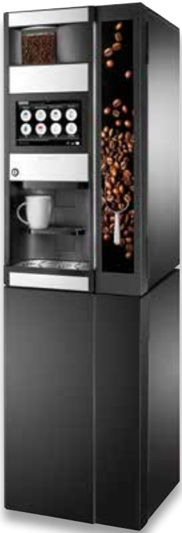
The elegant base stand enhances the design of the machine.